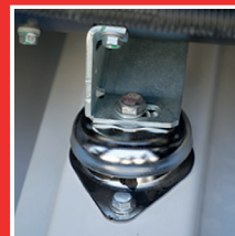
Anti-vibration pads attenuate vibrations caused by the unit