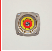
Emergency stop button