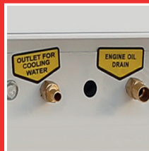
Oil and coolant drain