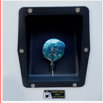
Fuel filling point with key lock