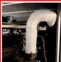
Exhaust pipes with exhaust heat wrap for high-performance and security