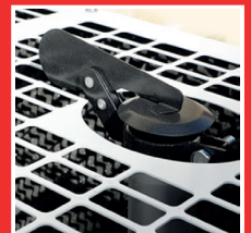
Exhaust terminal pipe with tilting cap rain over