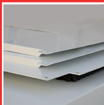
Galvanized metal sheet to increase strength & durability